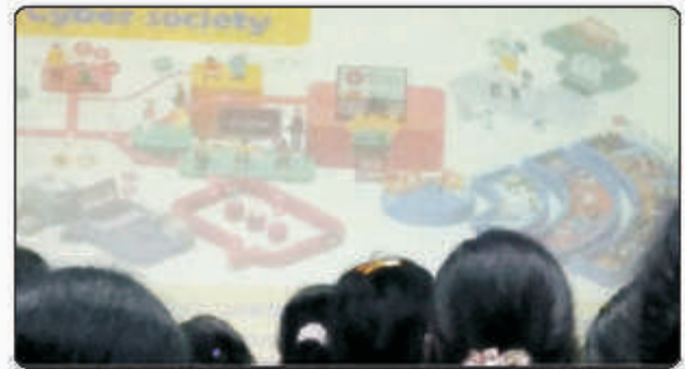
68 students and 2 faculties from CSE were visited the company "CDAC" Bangalore dated 16.08.2017